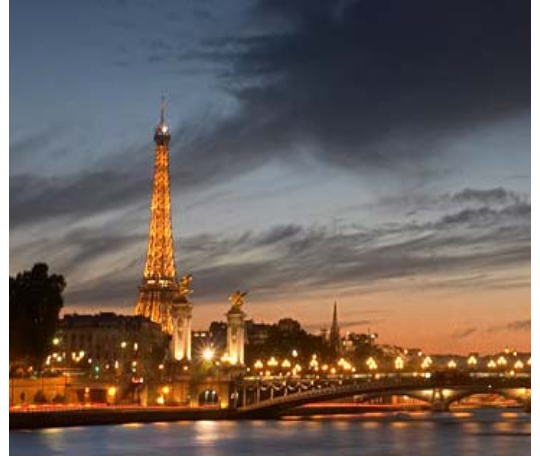
TRAVEL DATES: SEPT 16 - 25, 2008

Sept. 16 - Tuesday: Our overnight flight with dinner and breakfast departs Boston for Paris, France.